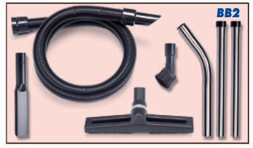
Also available 115V/120V specification.