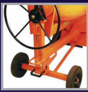
Foot Operated Tip Lock