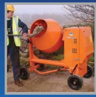
Robust Design To Withstand The Worst Site Conditions